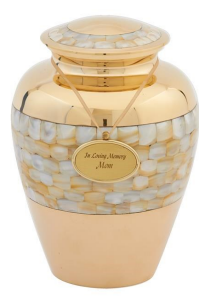
“Mother of Pearl” Polished Brass $895