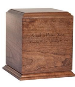
“Avon” Solid Cherry Wood $895