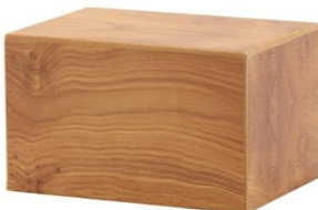
“Natural Veneer Chest” Veneer Wood $295