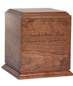
“Avon” Solid Cherry Wood $495