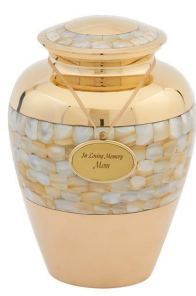
“Mother of Pearl” Polished Brass $595