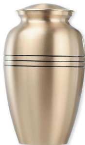
“Genoa” Brushed Bronze $595

We offer a wide variety of cremation urns for your selection, from simple, value-priced urns to those of extraordinary artisan quality. An extensive catalog is available on request. In this price list, we display a small, representative selection.