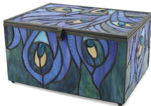
“Peacock Memory Chest” Colored Glass $495