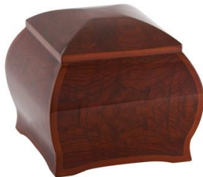
“Ceylon” Veneer Burl $595