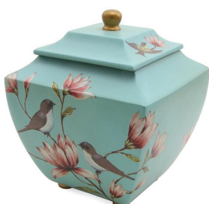
“Magnolia Songbirds” Painted Resin $595