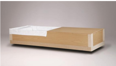
“Standard” $295 Presswood Container. Light woodgrain finish. Padding and pillow included.